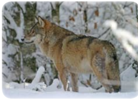
Above: The gray wolf, Canis lupus.

Last year, the U.S. Fish and Wildlife Service (USFWS) proposed to remove the gray wolf ( Canis lupus ) from the endangered species list, which will eliminate the current bans on hunting and trapping and any other special protections for the animal. The agency claims that the gray wolf no longer needs federal protection to prevent its extinction because its population has been “restored” to its historic range. However, scientific evidence shows that the historic range for the gray wolf includes the Adirondack Park which currently does not have a viable wolf population, proving protections are still needed.