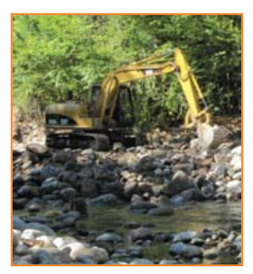
Ongoing restoration of Johns Brook, Keene Valley, NY, September 2013.

involving more than 100 volunteers on the East Branch of the Ausable River in Keene. That section of river was heavily damaged by Tropical Storm Irene in 2011. Volunteers planted more than 2,500 native trees, restoring 54,000 square feet of river buffer. Funding for the trees came from the NYS Environmental Protection Fund's Waterfront Revitalization Program.