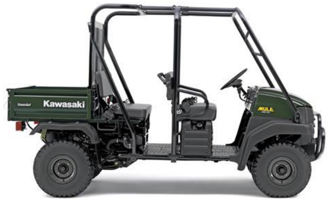
Examples of “side by side” two passenger vehicles