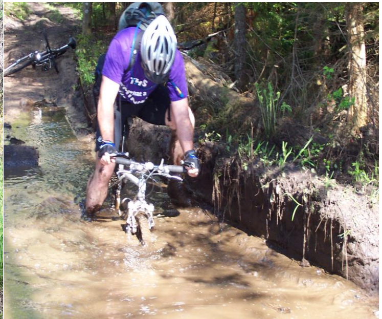
Mountain biker examines damage caused by ATVs (Left) and shows depth of mud hole (Right)