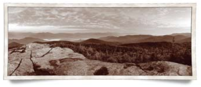
Join us in honoring: