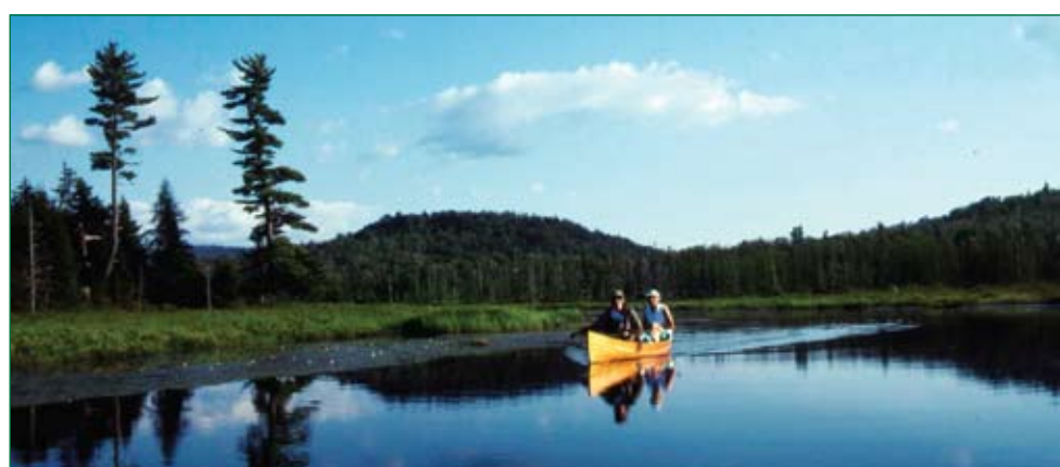
Channel to Rock Pond in the Bob Marshall Wild Lands Complex

In June the Adirondack Council released a new map of the Bob Marshall Wild Lands Complex, providing thousands of maps to gateway communities in time for the start of the summer outdoor recreation season. Department of Environmental Conservation (DEC) officials, local government leaders, and economic development non-profits joined the Council in Old Forge to announce the release of the Bob map. The Council is advocating with DEC to combine the 14 Forest Preserve units and manage them as one to protect the environment, create new recreation opportunities, and bolster the economies of gateway communities. Since the 1980s, Council members have advocated for protecting the 410,000-acre region. Today, more than 85% of the land has been protected either by state acquisition or conservation easement. Individual and family landowners carefully steward the adjacent private lands. It's time to celebrate and move the Bob forward in collaboration with agencies and gateway communities.