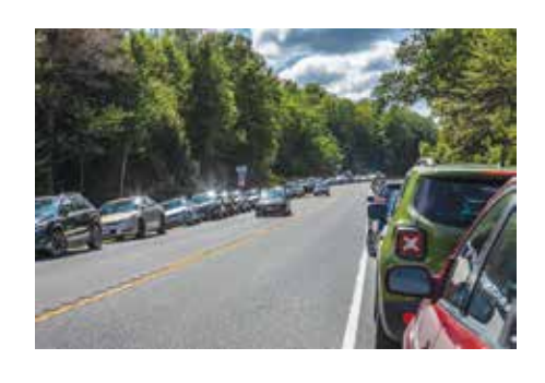
Cars parked near the Ampersand trailhead

and safeguarding the wilderness character that is so critical to the local economy. The Governor proposed funding to protect and provide for stewardship of wilderness.