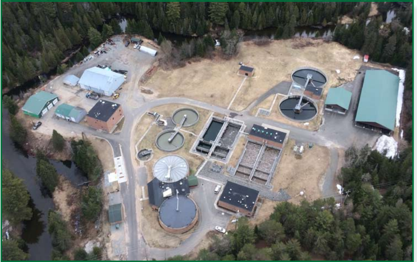
Aerial view of the Village of Lake Placid Wastewater Treatment Plant.