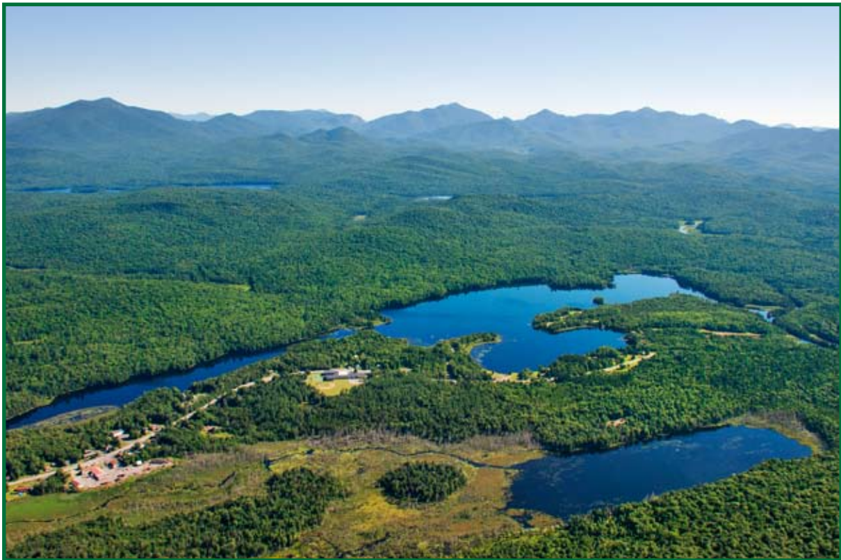
Community of Newcomb.

This report demonstrates that the grants coming to the Adirondacks from this clean water fund are an important step forward in protecting our water bodies and public health. It is critical that this grant funding program continue and grow while providing more technical assistance to Adirondack communities. Now is not the time to stop those investments if the environmental and economic needs of Adirondack communities are to be truly met. The time for investment is now, for the Adirondack waters and the communities that are at risk.