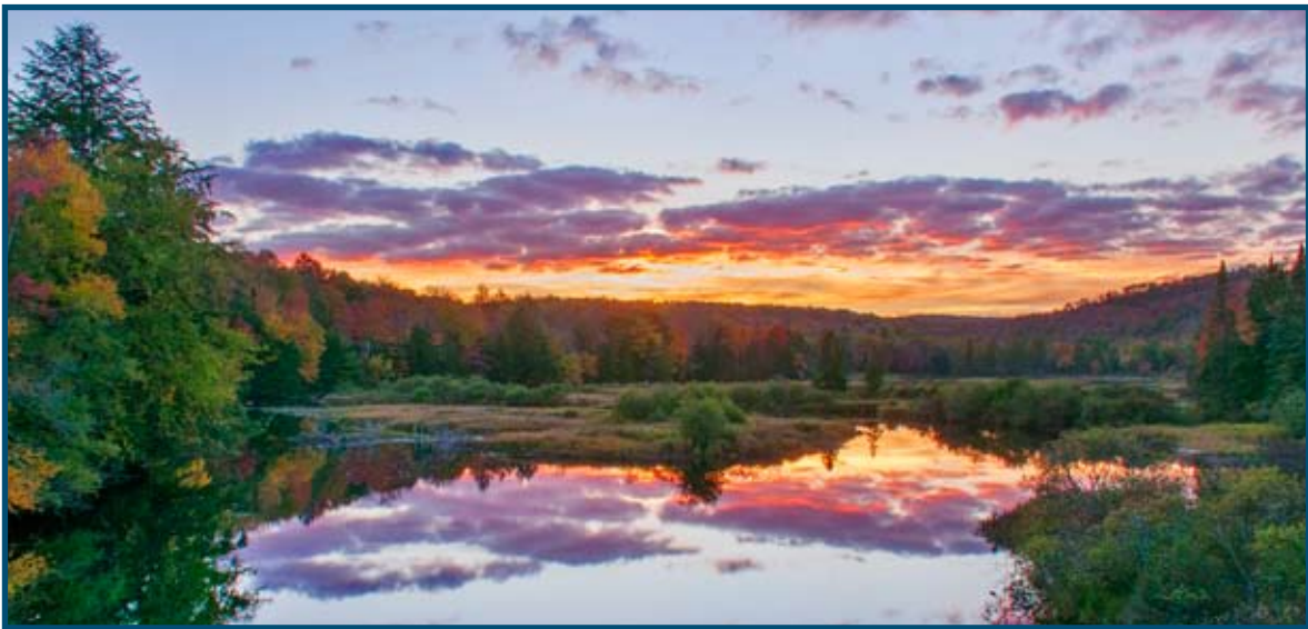
The Moose River.