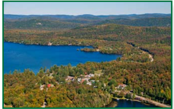
Community of Inlet.

In conclusion, the New York State Clean Water Grant program is vital to protecting this national treasure, the Adirondack Park. For almost 50 years, the Clean Water Act has provided the parameters for fishable and swimmable waters as well as protecting resources that provide communities with drinking water. In the early days, communities had federal construction grant funds to create their wastewater treatment facilities, but now many of them are out of compliance and/or have aged beyond their effectiveness. In the Adirondack Park, there are currently seven communities under consent orders by the NYSDEC for violations in their wastewater facilities' operations, further demonstrating the need for assistance to communities in the Park. Additional complex issues threatening the water quality of the Adirondack Park range from acid rain to more localized non-point sources of contamination. Run-off concerns include salt contamination from use and storage facilities as well as decentralized treatment systems, all of which contribute to the impairments Adirondack waters face. Emerging issues such as invasive species also play a role in the health of Adirondack lakes, rivers and streams thus adding to the mix of complex management solutions.