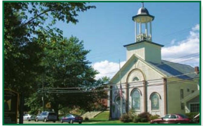
Community of Elizabethtown.

The clean water in and flowing from New York's globally unique six-million-acre Adirondack Park, including the Hudson and four other major rivers, is at risk. A commitment to the protection of Adirondack waters that generations of New Yorkers have made since the mid-19th century needs to be renewed. The Adirondack Clean Waters program will secure a new level of commitment to comply with the letter and spirit of the Clean Water Act and incentivize state and other investments of newly available funds in clean water infrastructure.