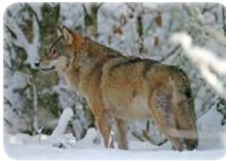
Above: The gray wolf, Canis lupus.

Last year, the U.S. Fish and Wildlife Service (USFWS) proposed to remove the gray wolf ( Canis lupus ) from the endangered species list, which will eliminate the current bans on hunting and trapping and any other special protections for the animal. The agency claims that the gray wolf no longer needs federal protection to prevent its extinction because its population has been “restored” to its historic range. However, scientific evidence shows that the historic range for the gray wolf includes the Adirondack Park which currently does not have a viable wolf population, proving protections are still needed.