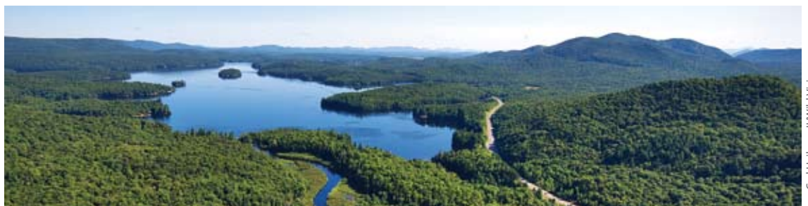
The Adirondack Club and Resort proposes development of Mt. Morris (pictured in the distance) and the surrounding forest lands.

After months of delays (per requests by the developer), the developer and interested parties in the 700-unit Adirondack Club and Resort project in Tupper Lake agreed on January 25 th to proceed with mediation for the project. This mediation process is an effort to settle some concerns of environmental organizations and local citizens, and expedite the formal hearing process that will follow. The Council has agreed to confidentiality amongst the parties for the duration of the mediation, scheduled to begin in March. If you don't hear any news, you can assume positive progress. Otherwise, expect to hear from us loud and clear.